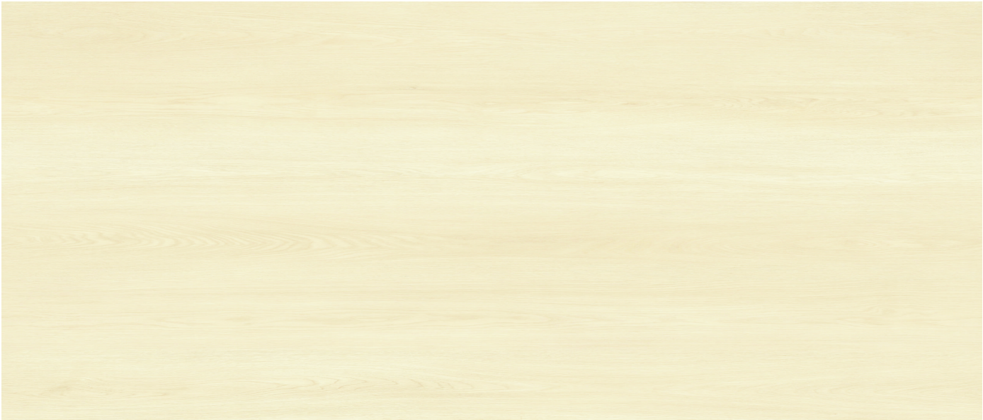
SW 55211 Yosemite