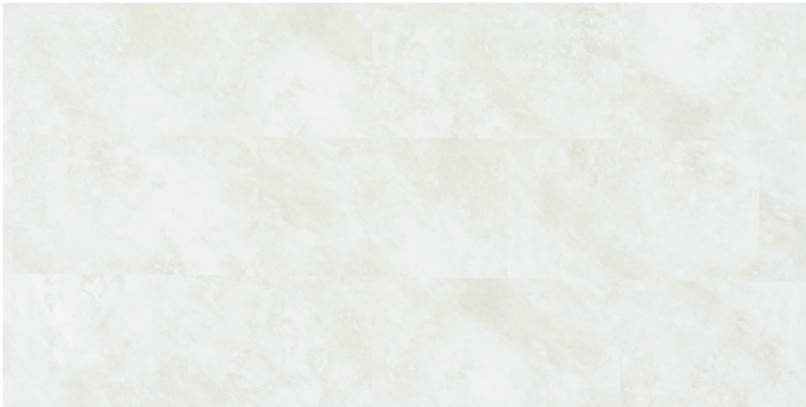
SK 3658 T Mount Everest

Tile 12" x 24" x 5mm Size : 305 x 610 x 5mm