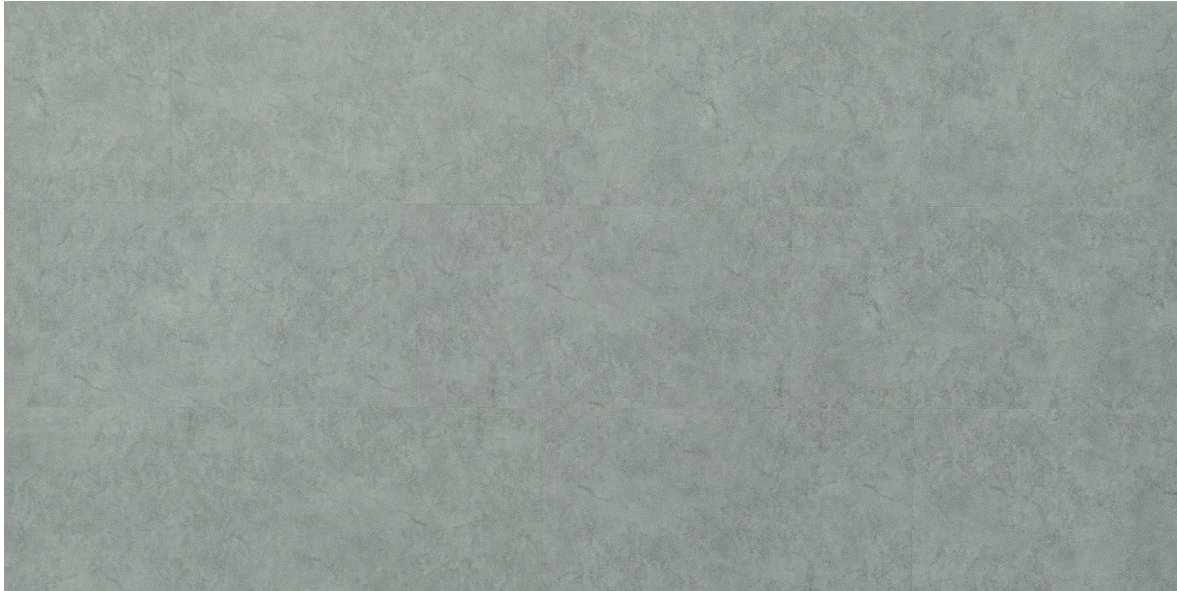
SK 3636 T Beton