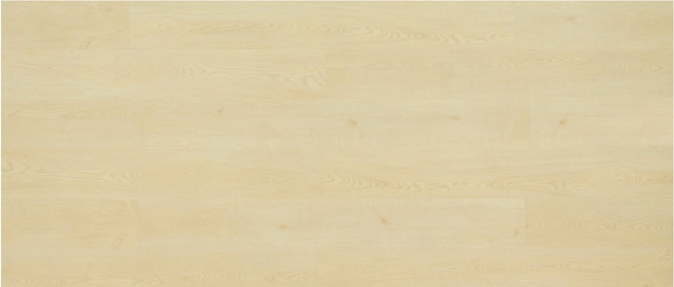
SW 55123 Giza