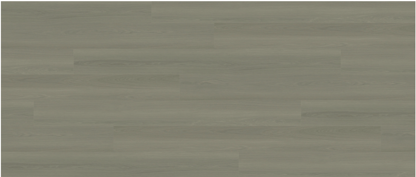
SW 55266 Cerrado