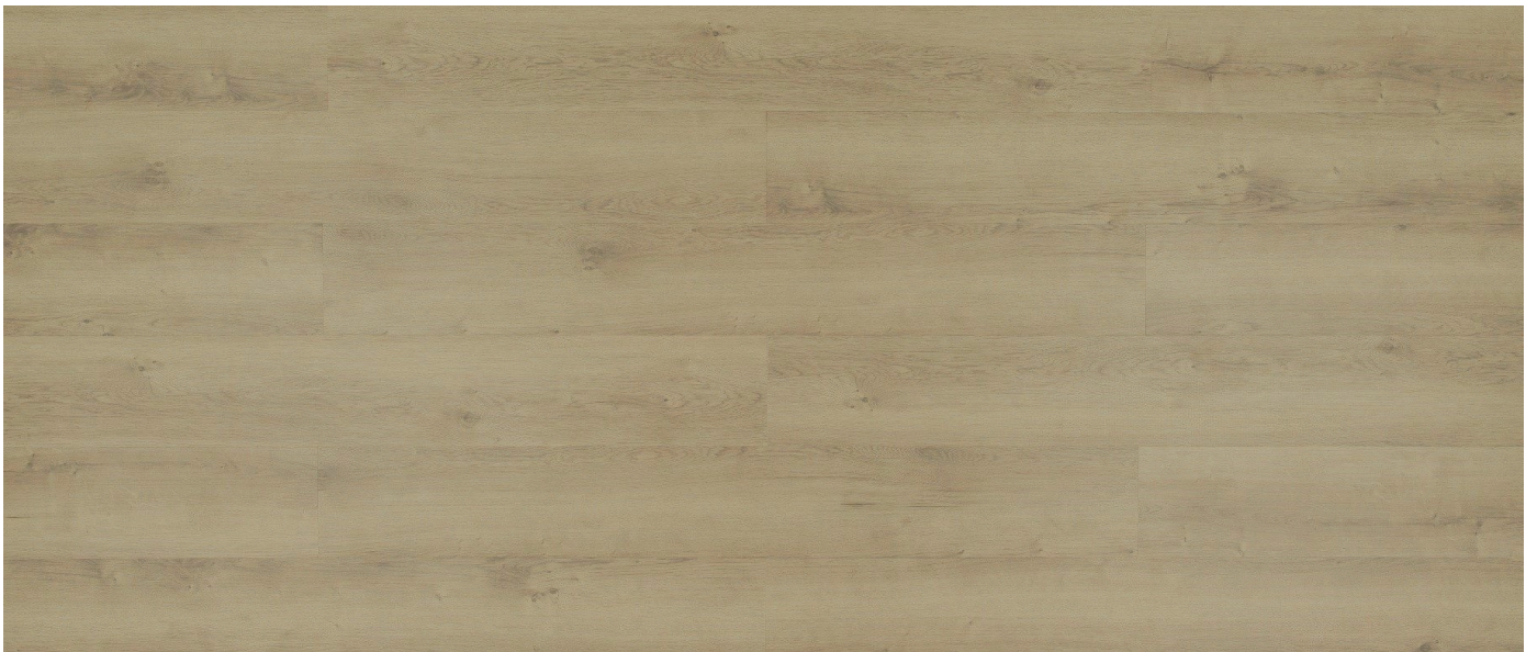
SW 55126 Windsor