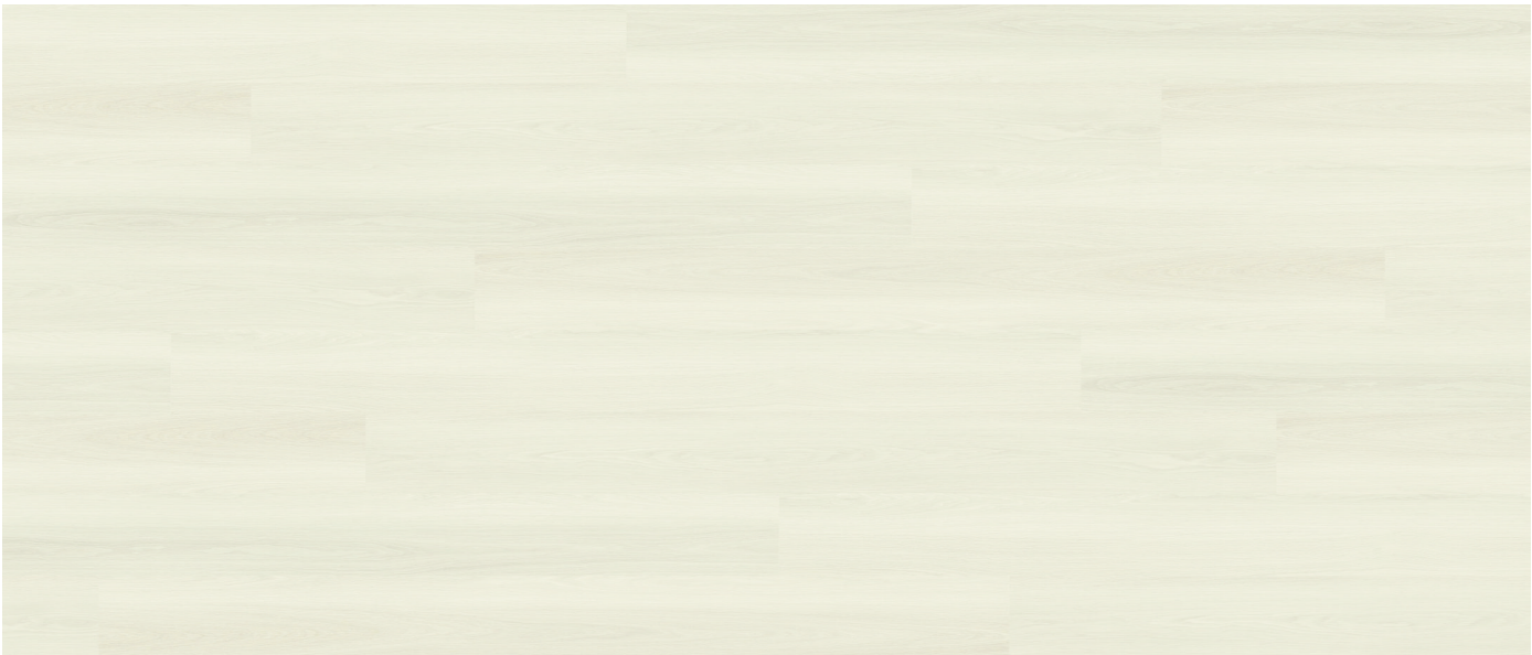
SW 55122 Karst