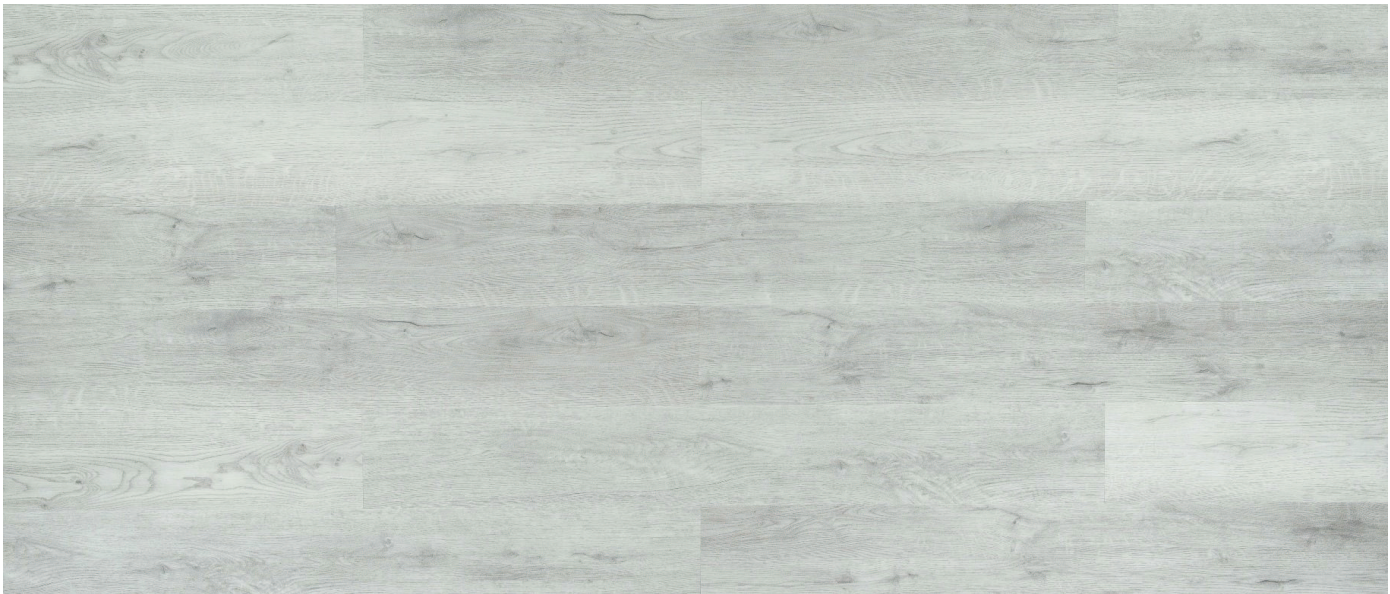
SW 55137 Jurassic