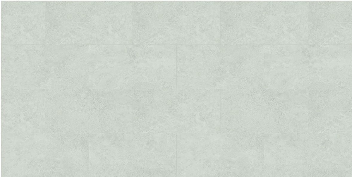
SK 3663 T Fuji