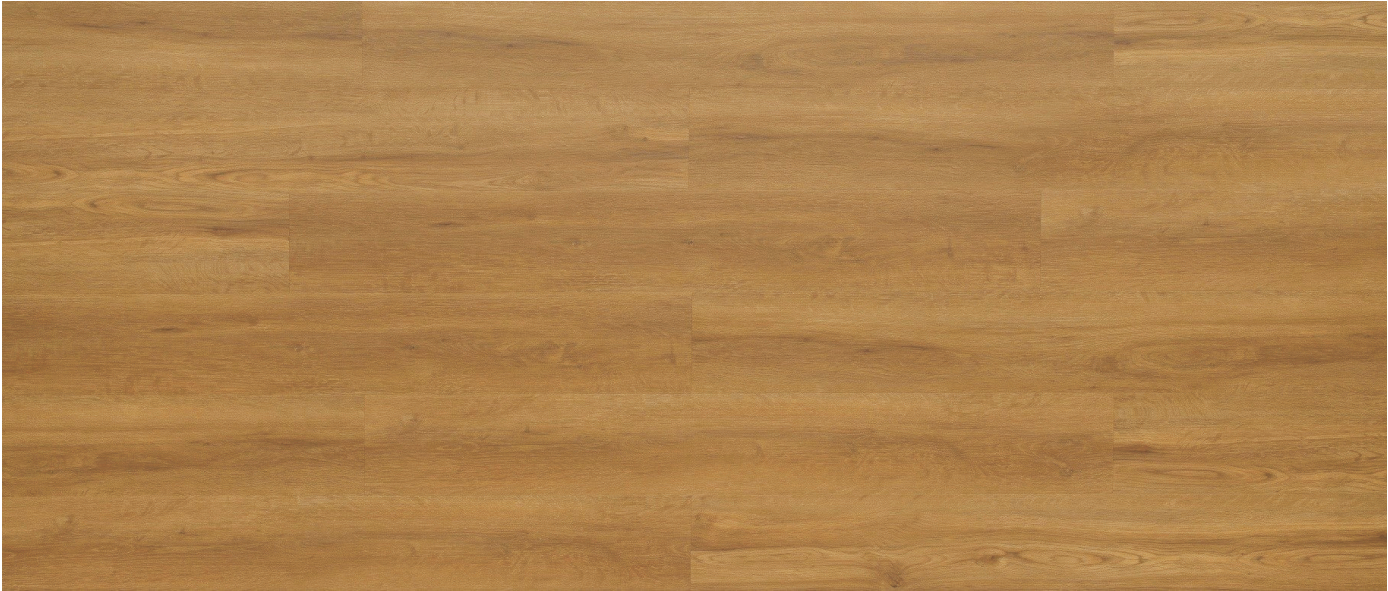
SW 55251 Castillo